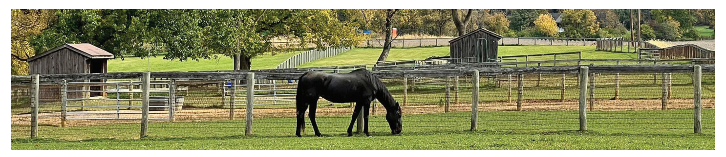
NOTE: Buying grain, hay, treats, or ulcer medication is YOUR special gift to the horses only. Mylestone does not send gift announcements for these items. If you wish to send a gift, please consider a Valentine Gift Sponsorship. Thank you for understanding.